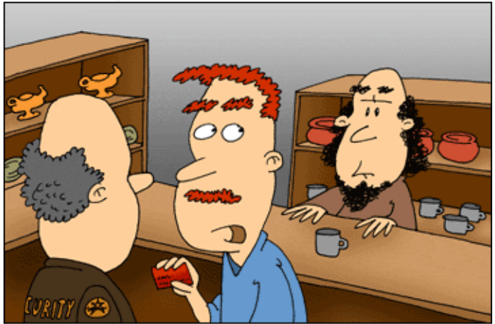
(See Acts 9:1-19) 04-28-2003

THE VERY MOMENT WHEN GOD MADE THEIR ENEMIES INTO THEIR FOOTSTOOLS