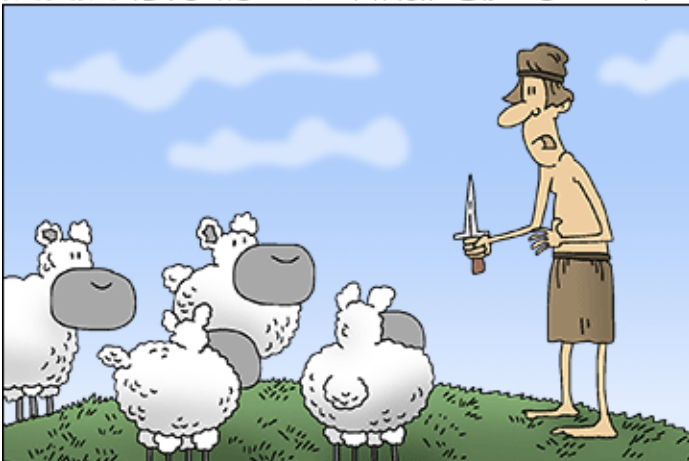
05-09-2014 AS A GOOD SHEPHERD I CARE FOR YOU AND STUFF, BUT AT THE END OF THE DAY YOU ARE STILL FOOD