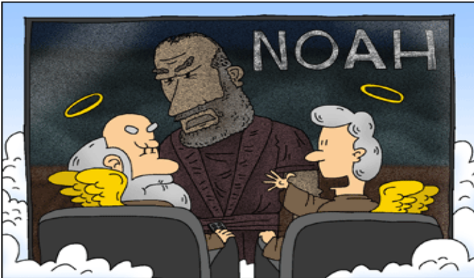
(See Genesis 6-8) 03-28-2014 SURE IT MIGHT NOT BE QUITE THE WAY YOU REMEMBERED IT ... I, FOR EXAMPLE, DON'T QUITE REMEMBER YOU BEING RUSSELL CROWE