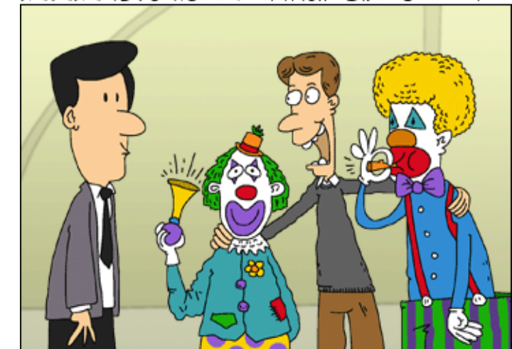
(See Psalm 100) 04-21-2014 YOU WANNA MAKE A JOYFUL NOISE TO THE LORD? THESE ARE YOUR GUYS!