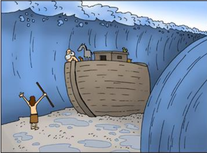
02-07-2014 MOSES AND NOAH HAVING AN ARGUMENT