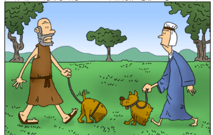
(See 1Kings 3) 04-11-2014 SOMETIMES WHEN SOLOMON RESOLVES A CONFLICT NOBODY WINS